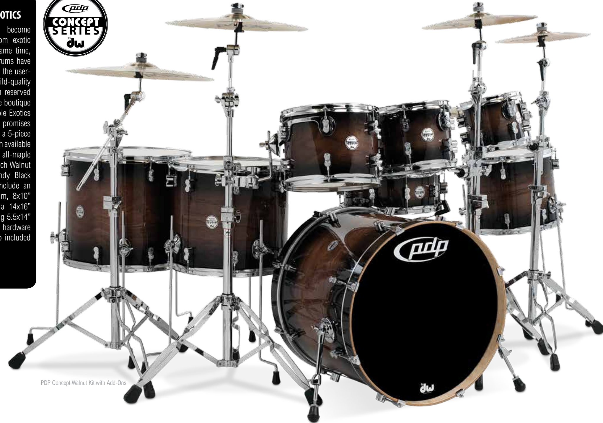
PDP Concept Walnut Kit with Add-Ons