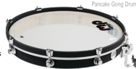
Pancake Gong Drum

Crafted from North American Maple and finished in neutral Flat Black, the all-new "Pancake" Gong Drum was created to mimic the sound characteristics of full-sized gong drums, yet they can pack up in seconds. Mounted from a single TB12 tom bracket and fitted with signature Design Series™ mini lugs, this single-headed, 20" diameter drum packs plenty of punch and can integrate into the tightest set-ups.