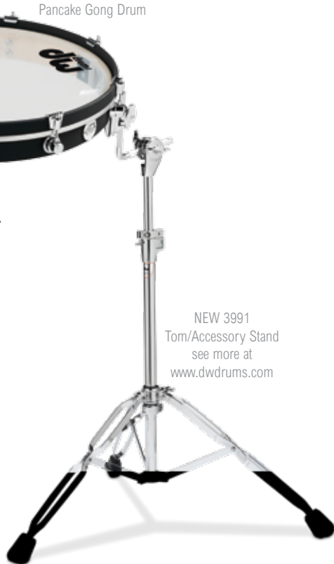
NEW 3991 Tom/Accessory Stand see more at www.dwdrums.com