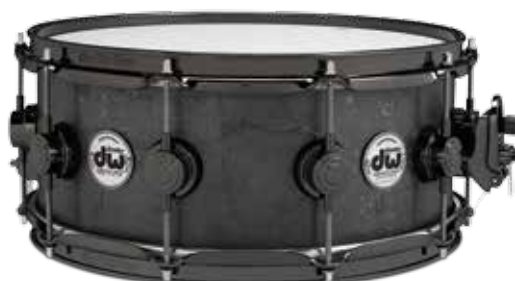
6 x 14" Black Iron Snare

World-famous drum builder Gregg Keplinger has hand-crafted only 50 of these metal shells that have been carefully assembled in California by DW's team of skilled craftsmen. Its raw beauty is true to the Keplinger tradition, while its state-of-the-art functionality can be attributed to the latest DW drum hardware advancements, such as True-Hoops™, True-Tone Snare Wires™, True-Pitch 50 Tuning, MAG Throw-Off System with 3P butt-plate, and DW Heads by Remo USA. Complemented with Black Nickel hardware and nestled in a deluxe padded carrying case with a signed certificate of authenticity, the Black Iron snare is an extremely rare limited edition drum that's made to be played.