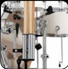
Double Stick Holder