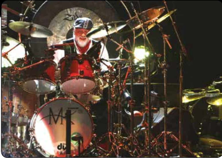
6.5 x 14" Mick Fleetwood "Rumours" Icon Snare

IN AN EFFORT TO FURTHER EXPAND THE EVER-GROWING SELECTION OF COLLECTOR'S SERIES® SNARES, DW HAS PRODUCED A WIDE VARIETY OF NEW SELECTIONS FOR 2016. TO SEE THE FULL LINE-UP OF DW SNARE DRUMS, LOG ON TO: WWW.DWDRUMS.COM .