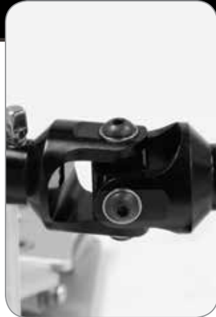
AB™ All-Bearing Universal Joint