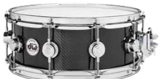
5.5 x 14" Carbon Fiber Snare

Carbon fiber isn't a new drum-making material, but it is for DW. For years, players have asked about incorporating carbon fiber into the Custom Shop line-up. Many prototypes have been made and our testing has finally produced a shell that is good enough to make the cut. Offered in 5.5x14" and 6.5x14" sizes and available in any custom drum hardware color option, the Collector's Series Carbon has volume! It provides plenty of cut for loud playing situations, but it's also dynamically sensitive. Another choice from the Drummer's Choice®.