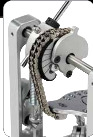
Machined Chain Drive Cam