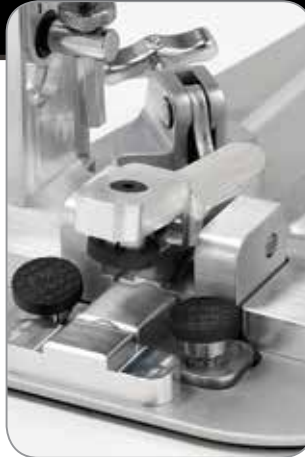
Tri-Pivot™ Swivel Toe Clamp