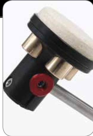
Adjustable 110 Control™ Beater