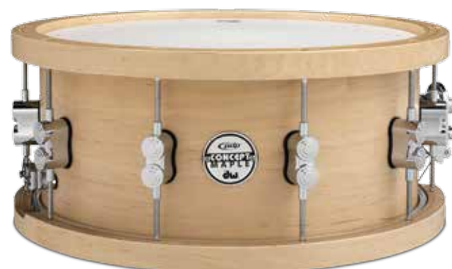
PDP 20 Ply All-Maple Concept Wood Hoop Snare

See the full line of PDP snares at: www.pacificdrums.com .